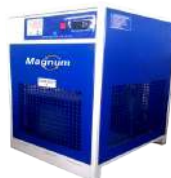
100 CFM AIR DRYER