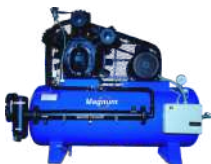
25HP/18.5KW AIR COMPRESSOR