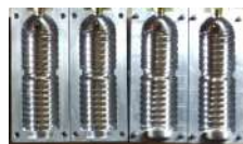
4 Cavity ONE FAMILY MOULD (300ml-500ml-1000ml&2000ml)