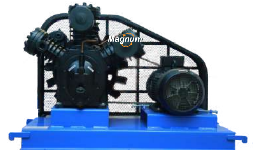
Base Mounted Compressor