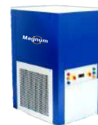
TWO TON WATER CHILLER